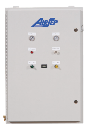
PSA Concentrator Module